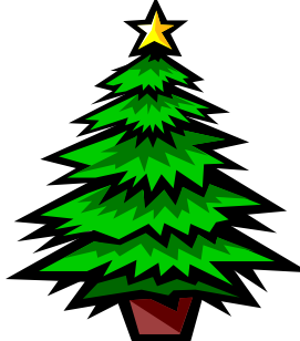
A CHRISTMAS TREE