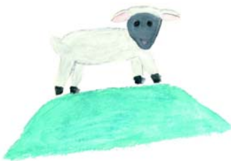
LIMESTOCK (THAT'S HIS NAME)